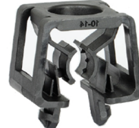
PSPS-1014-10 PIM Shield Plastic Snap-in 10 to 14 mm, Qty. 10