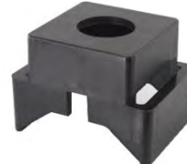
901044-10 PIM Shield Multi-Function Snap In Adapter, 1 Position, Qty 10