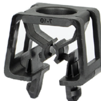
PSPS-0407-10 PIM Shield Plastic Snap-in 4 to 7 mm, 10/Pkg