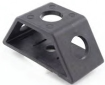
900860-10 PIM Shield Snap-in Adapter, Trapezoid, 3 Pos, 10/Pkg