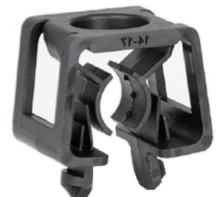
PSPS-1417-10 PIM Shield Plastic Snap-in 14 to 17 mm, Qty. 10