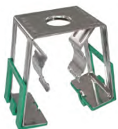
PSHS-3642-10 PIM Shield Hybrid Snap-In, 36 to 42 mm, (1-1/4-in), 10/Pkg