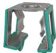
PSHS-2630-10 PIM Shield Hybrid Snap-In, 26 to 30 mm, (7/8-in), 10/Pkg