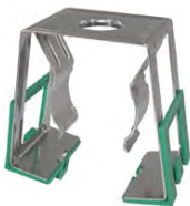
PSHS-4852-10 PIM Shield Hybrid Snap-In, 48 to 52 mm, (1-5/8-in), 10/Pkg