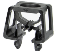
PSPS-0710-10 PIM Shield Plastic Snap-in 7 to 10 mm, Qty. 10