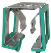
PSHS-1319-10 PIM Shield Hybrid Snap-In, 13 to 19 mm, (1-1/2-in), 10/Pkg